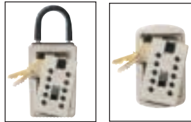
Door Knob Mount

There are two styles of key lockbox available. The first hangs on the door knob or handle and requires no installation. The second would be surface mounted near the door.